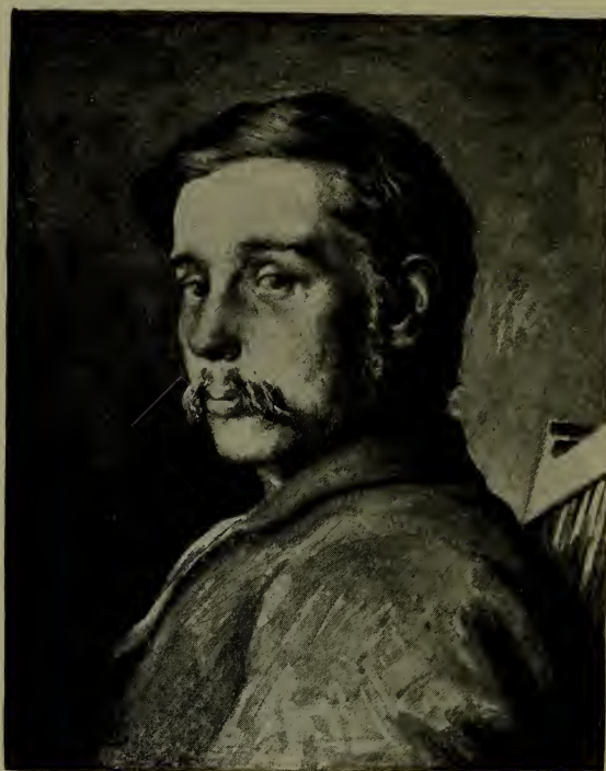
H. G. WELLS