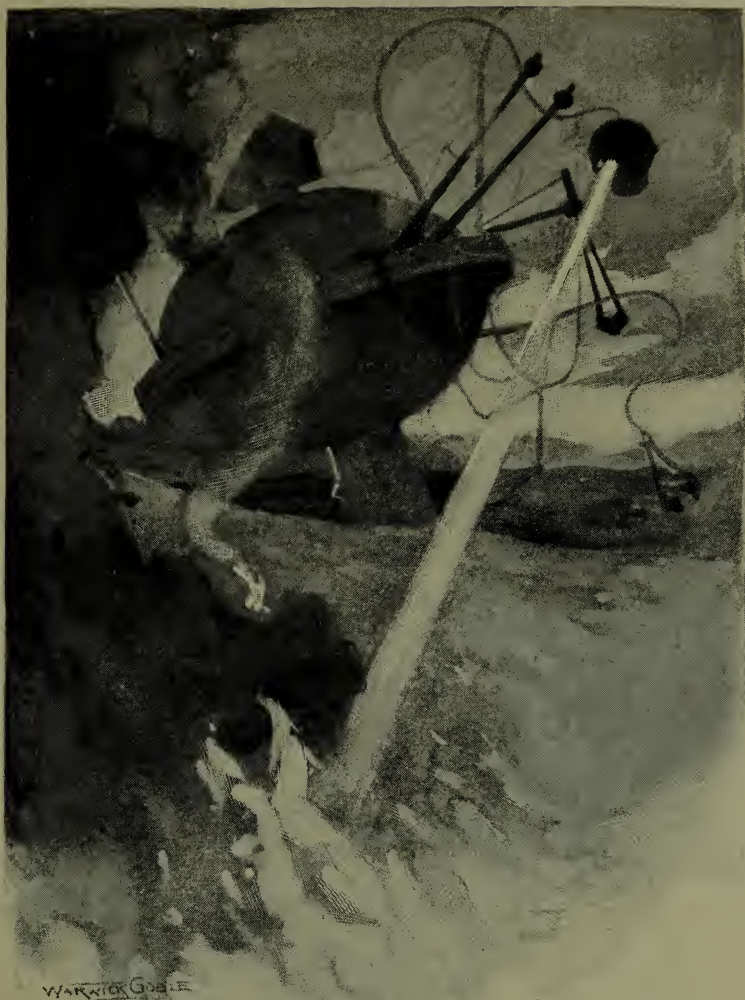
"PROJECTED BY MEANS OF A HUGE PARABOLIC REFLECTOR"